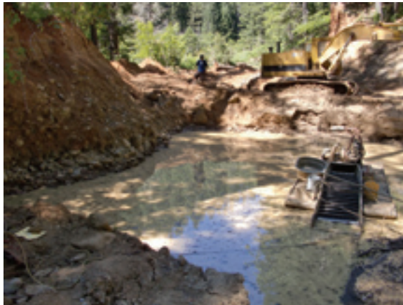
DIRTY MINING: Illegal activity along Galice Creek resulted in pollution that harms fish and aquatic life.