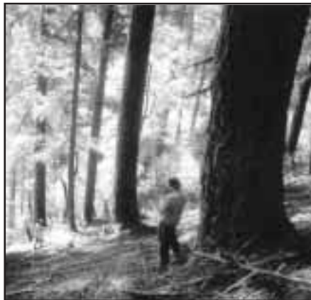
KS Wild staffers surveying an old-growth timber sale in the Rogue River watershed.

Succumbing to an insatiable hunger to devour late-successional forests, the BLM Field Manager went as far as to reject many of her own specialists' mitigation measures designed to lessen the effects of this clearcutting. The requests of the BLM's own botanists for no-cut buffers around three rare plant species were rejected as inconveniencing the "structural retention harvest" of your forests. Similarly, the BLM biologist was rebuffed in his hopes to establish a five-year monitoring program to examine the effects of this clearcutting on resident Northern Spotted Owls.