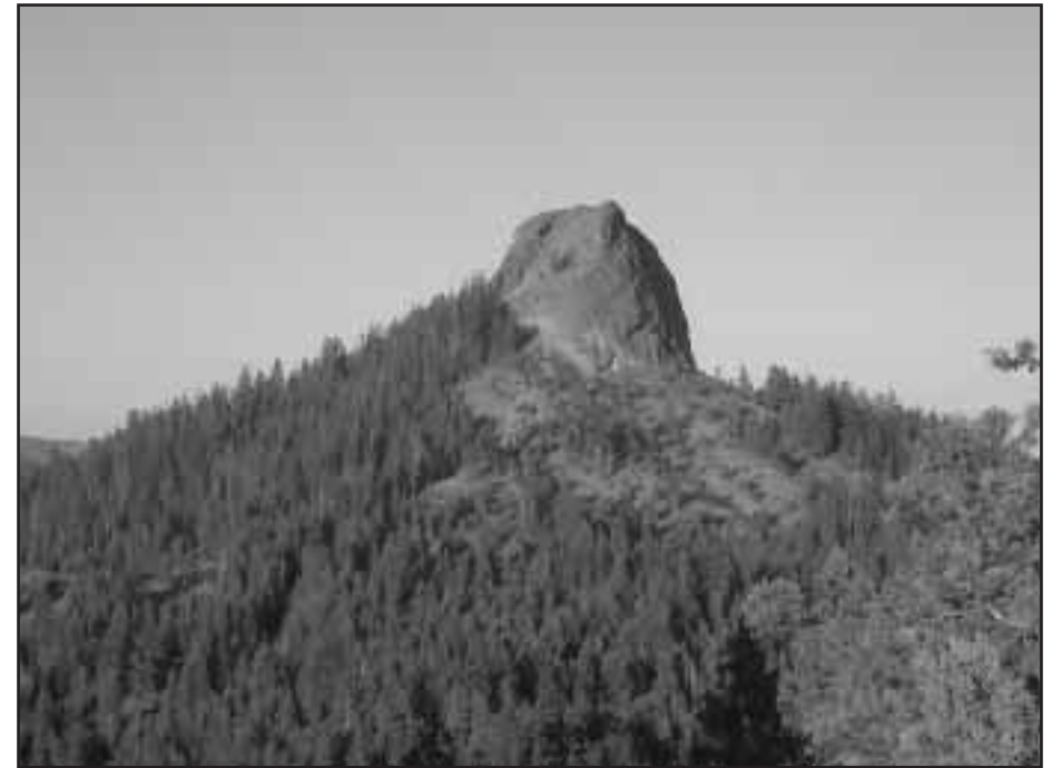
The Cascade-Siskiyou National Monument's Pilot Rock. KS Wild is working hard to keep it's borders from shrinking.

Klamath-Siskiyou Wildlands Center PO Box 332, Williams, OR 97544 • 541-846-1352 PO Box 102, Ashland, OR 97520 • 541-488-5789 liz@kswild.org • http://www.kswild.org