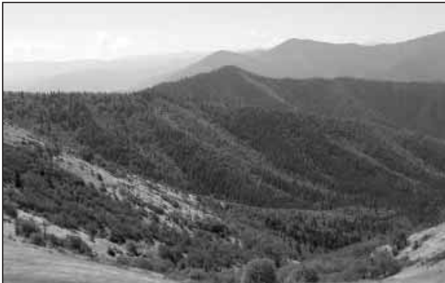
The roadless Ferris Bugman area.

Last Autumn, the Medford BLM unveiled its plans to build seven miles of new road and log one of the last remaining low elevation, mature, roadless forests in the Applegate Valley. Located between Humbug and Slagle Creeks on the north side of the