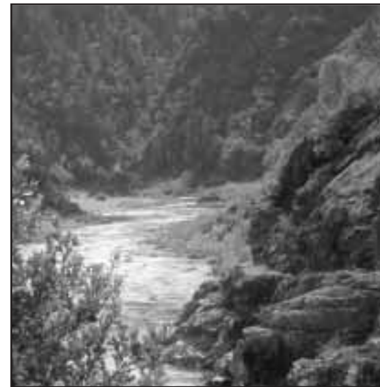
The Rogue River, adjacent to the 46,646 acre Zane Grey Proposed Wilderness Area.

The Medford district also possesses the largest forested roadless area on BLM land: the Zane Grey, along the Wild and Scenic Rogue River. This area has been proposed for Wilderness designation this year.