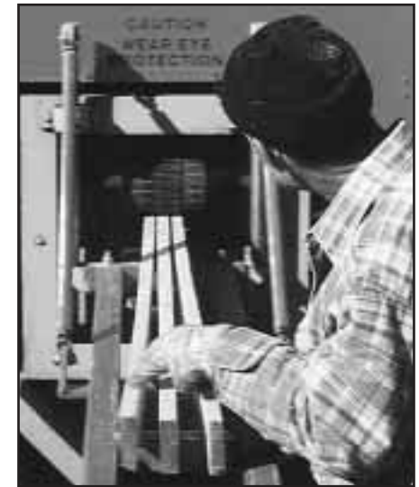
The Economizer Mill—small diameter trees in one end, and dimensional lumber out the other.

Ponderosa pines. Growing on a former hayfield, the site was a thicket until two years ago, when I began thinning and removing ladder fuels. Most of the material removed in this initial round of thinning was chipped, since it was too small to be “economized”. This year, the Lomakatsi crew was able to focus their efforts on trees that were the perfect size for the Economizer. More than 600 poles 8' to 12' long were sorted and ready when the Economizer arrived. At the end of the day, more than 4,000 board feet of lumber was stacked and stickered, ready to air-dry for a year before being turned into trim, paneling, and shelving.